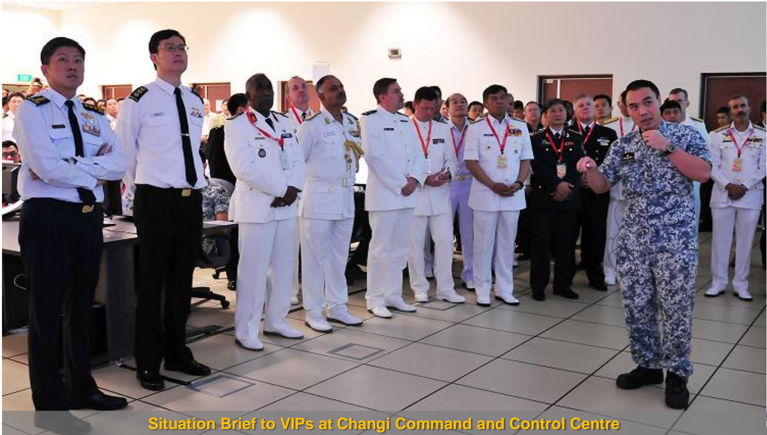
Situation Brief to VIPs at Changi Command and Control Centre